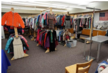
Area Learning Center - 2449 Orchard Lane, White Bear Lake